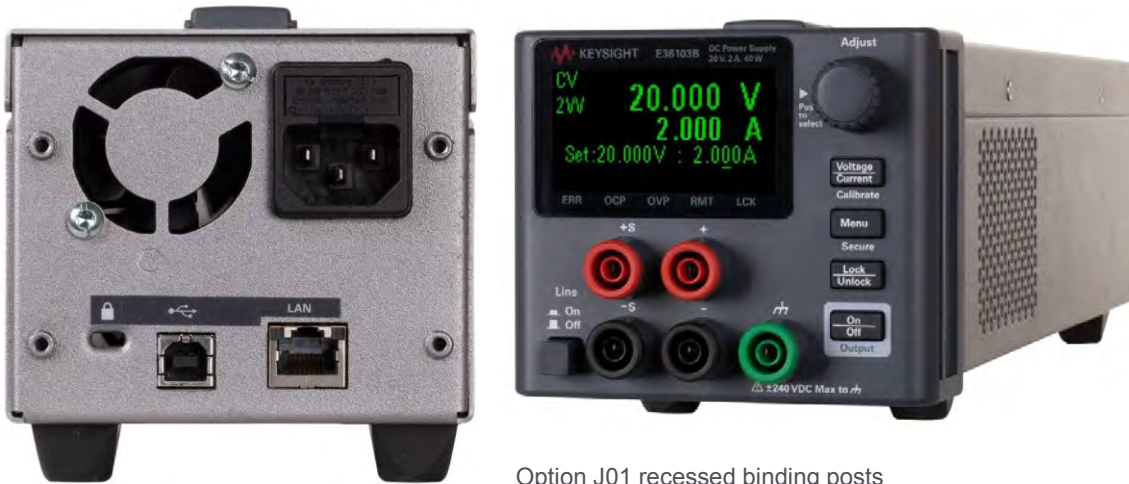
Option J01 recessed binding posts

Connect for computer control with standard LAN (LXI Core) and USB connectivity. Use the security slot to keep the supply on your bench.